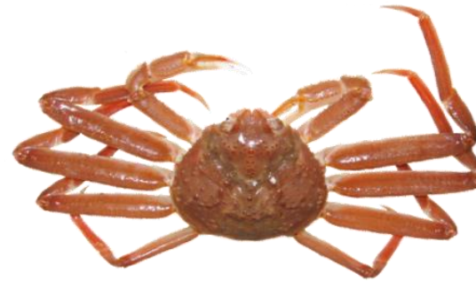
Snow crab ( Chionoecetes opilio )